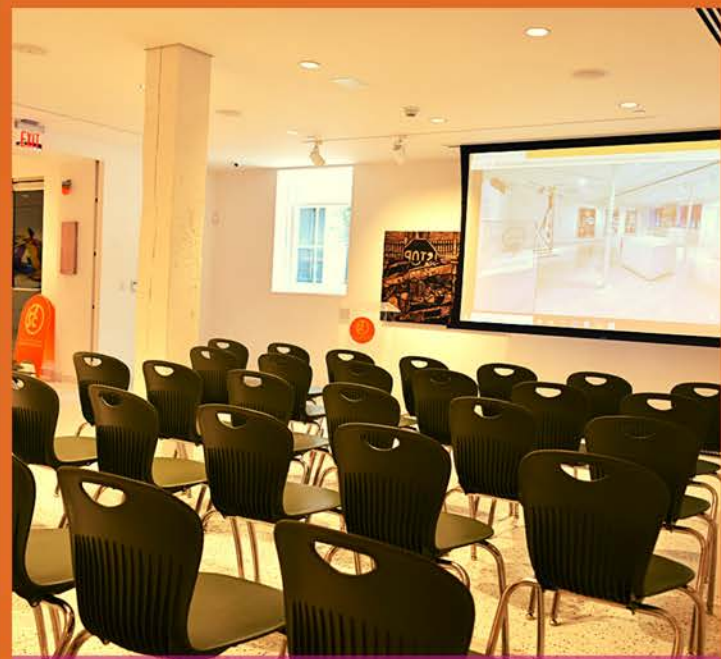
THE EDUCATION GALLERY: THEATER STYLE