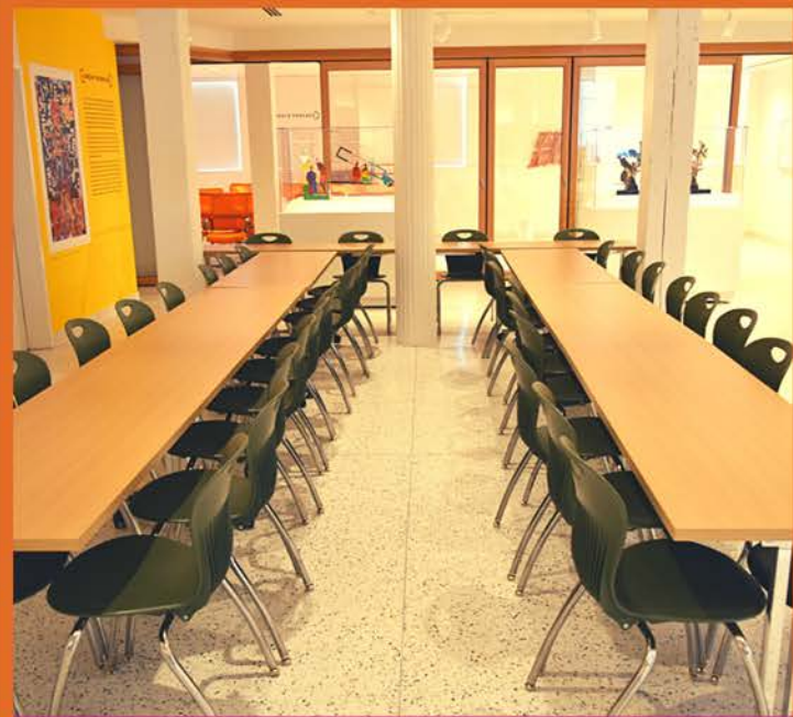
THE EDUCATION GALLERY: CLASSROOM STYLE