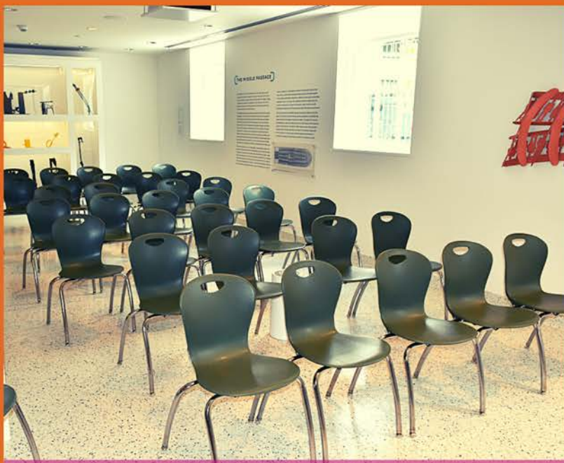
THE CENTER BOARDROOM: THEATER STYLE