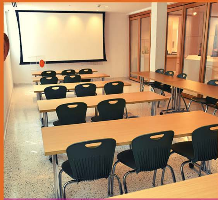
THE CENTER BOARDROOM: CLASSROOM STYLE

Seats 24 guests, classroom style Seats 36 guests, theater style