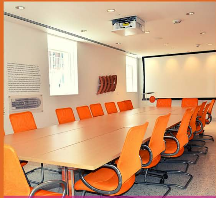
THE CENTER BOARDROOM: CLASSROOM STYLE