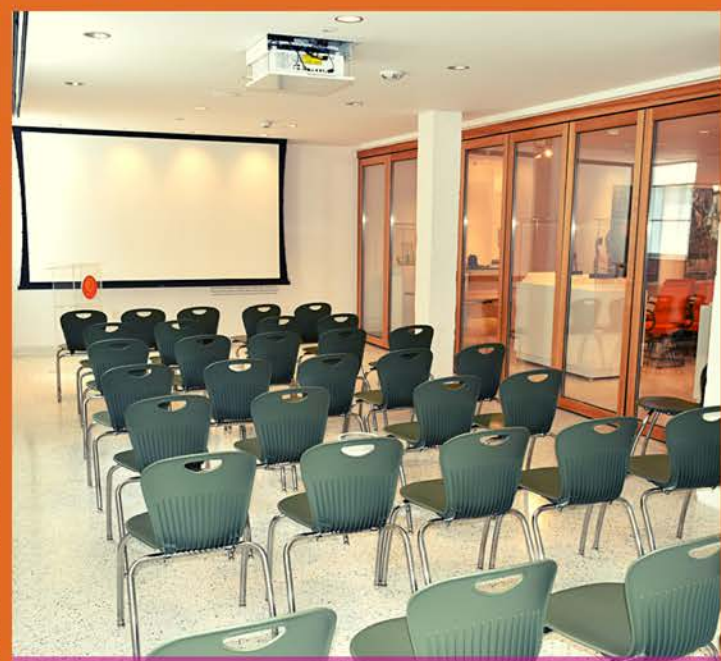
THE CENTER BOARDROOM: THEATER STYLE